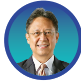
BUDI GUNADI SADIKIN

MINISTER OF HEALTH REPUBLIC OF INDONESIA