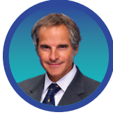
RAFAEL MARIANO GROSSI*

MINISTER OF HEALTH REPUBLIC OF INDONESIA