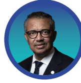
TEDROS ADHANOM GHEBREYESUS*