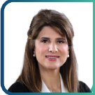
HRH PRINCESS DINA MIREĐ

Kingdom of Jordan, Global Advocate for cancer Control